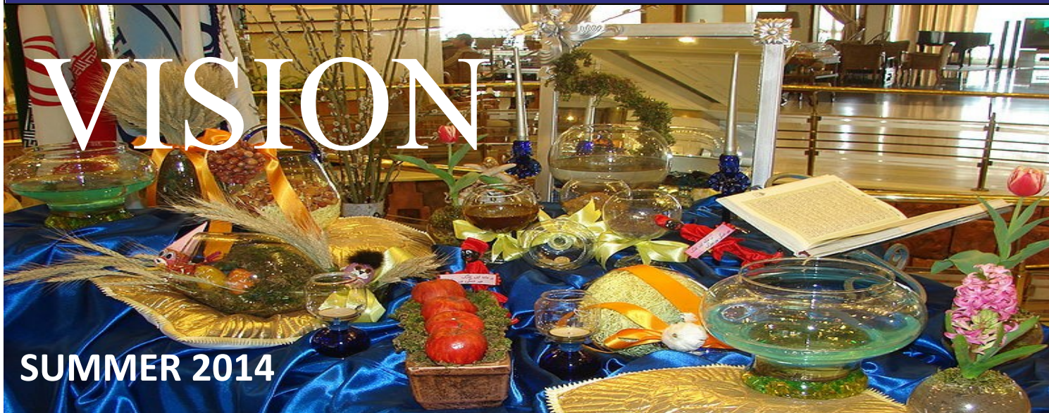
a Haft Sen Table as seen at Laleh Hotel, Tehran